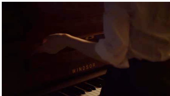
Futoshi Miyagi How Many Nights 2017 single channel video, sound, 38 minutes (still image) © Futoshi Miyagi / Courtesy of Gallery Koyanagi