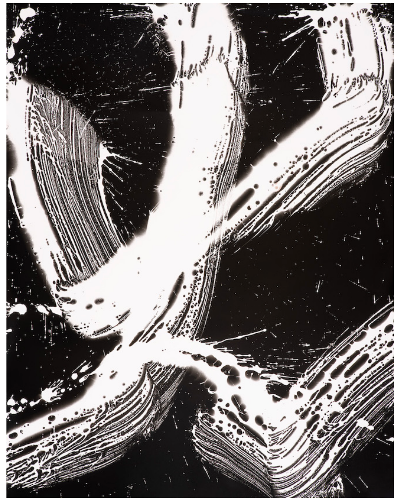
Hiroshi Sugimoto, Brush Impression 0884, 2023